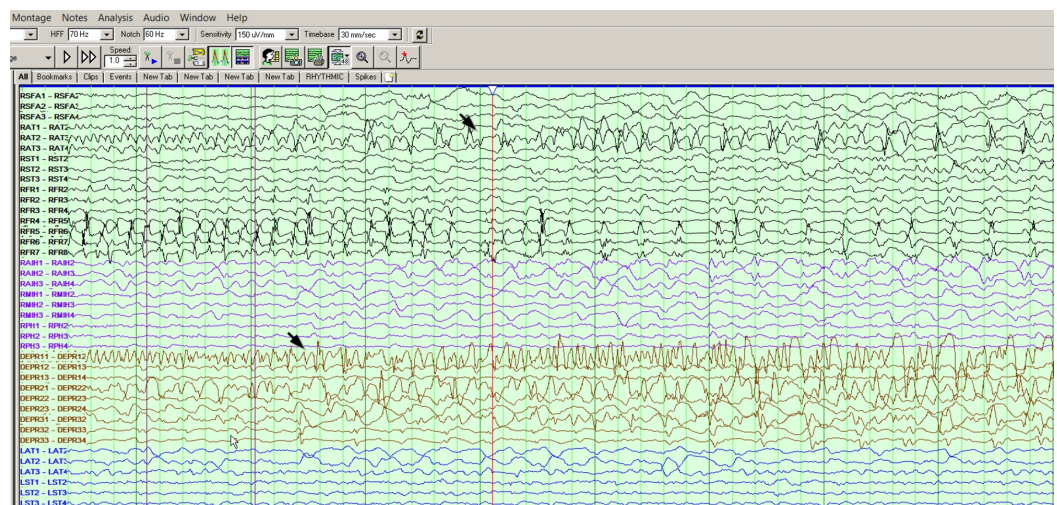
FIGURE 3: Secondary spread to the right hippocampal and lateral temporal electrodes