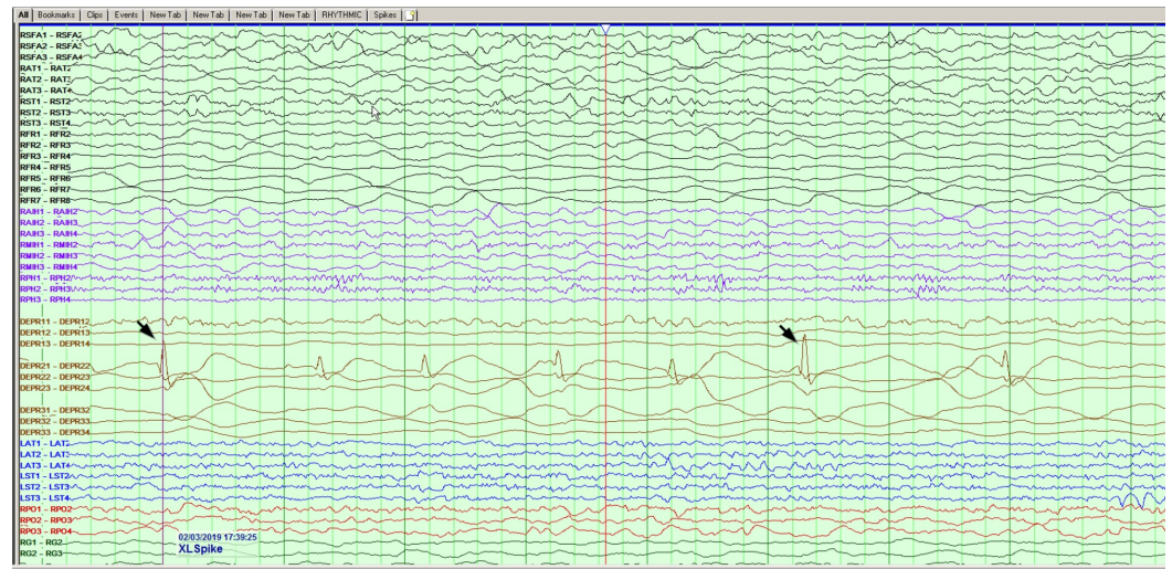
FIGURE 1: Interictal sharp waves noted from depth electrodes at the right anterior insular region

ECoG done during the operation confirmed that seizures were originating from the right anterior insular cortex and rapidly spreading to the right frontal and temporal operculum (Figures 1-3).