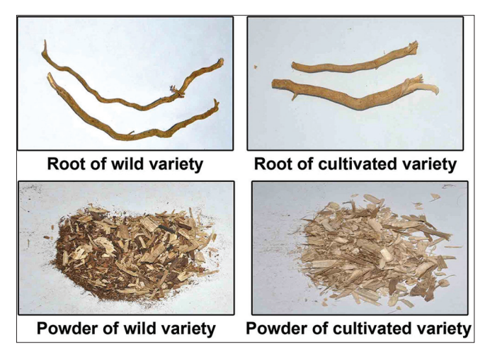
Figure 1: Raw and crushed roots of wild and cultivated variety