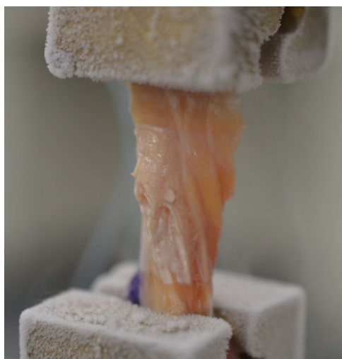
Figure 4. Tendon construct testing with an all-electric dynamic test load system.