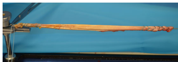
Figure 1. Gracilis and semitendinosus tendons whipstitched together before production of the final graft construct.

All fresh-frozen cadaveric knees used in this study were granted from Science Care. The mean \pm SD age was 61.17 \pm 10.38 years (range, 49-74 years). The cadavers were thawed, and after graft harvest, the grafts were immediately tested. All grafts were handled in similar fashion. The QTs and HTs were harvested from 6 cadavers, producing a total of 12 grafts. For the HT harvest, the gracilis and semitendinosus tendons were identified after reflection of the sartorial fascia. The tendons were isolated, and a tendon stripper was used to harvest each tendon. Muscle was stripped off the proximal tendon, and the tendons were shortened to a length of 24 cm. The tendons were combined and a No. 2 FiberLoop suture (Arthrex) was used to whipstitch each end for handling purposes (Figure 1). No. 2-0 FiberWire (Arthrex) was used to create a tripled, 6-strand HT construct, demonstrated in Figures 2 and 3. The graft was measured, and a corresponding diameter QT-specific cutting guide (Arthrex) was used to harvest the QT. This