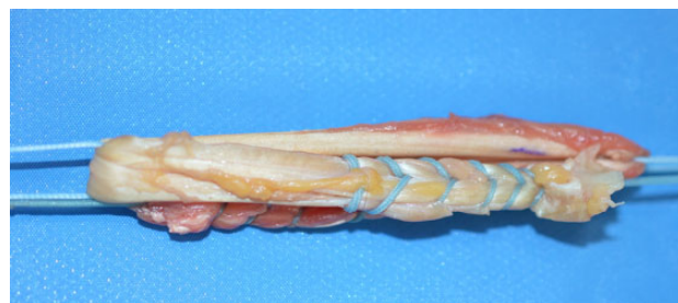
Figure 3. Final 6-strand hamstring tendon construct before testing.

cutting guide was used on the central aspect of the QT, and a combination of a scalpel and Metzenbaum scissors were used to dissect and amputate the graft proximally. This all-soft tissue graft was then shortened to approximately 8 cm in length and whipstitched in similar fashion on each end, and the final diameter was recorded. All grafts were 8 cm in length for biomechanical testing purposes.