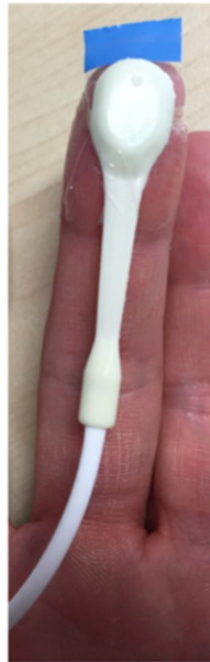
Fig. 1 Correct position of the detection probe