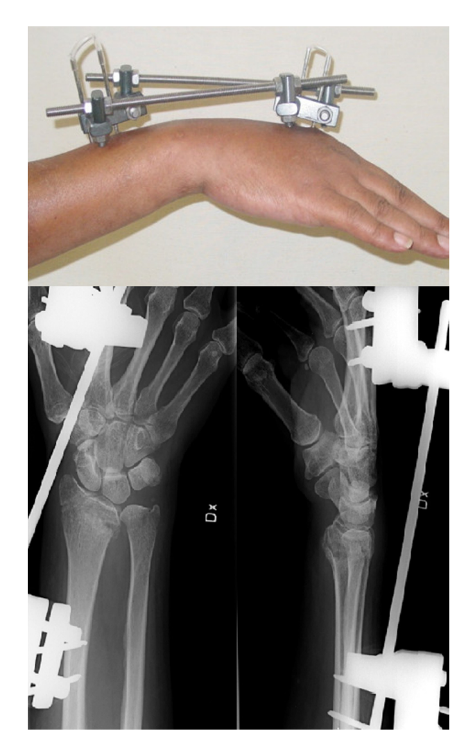
Figure 3 An external fixator.

One technique to prevent fracture displacement is to use percutaneous pinning as an augmentation to external fixation. Biomechanical studies have shown increased stability.<sup>44</sup>