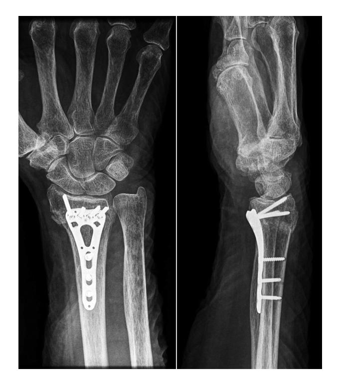
Figure 2 X-ray of volar locking plate.

A retrospective analysis of 24 distal radius fractures in patients aged over 75 years treated with a volar fixed-angle