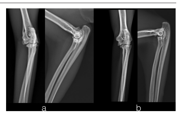
Fig. 4. Long-term radiographic follow-up at three years after surgery showed moderate radiographic evidence of osteoarthritis. Cranio-caudal and medio-lateral views (a-case 1 and b-case 2).

The general appearance of an animal with a caudal elbow luxation is quite simple to recognize. The patient has a 4/4^{\circ} lameness appearing acutely, the antebrachium and foot are externally rotated, and the elbow is in the extended position. There is usually marked pain with resistance to flexion and extension. Although the basic diagnosis can be made by physical examination, radiographs in two planes are necessary to look for associated fractures and suspect ligaments avulsion (Brinker et al. , 2016).