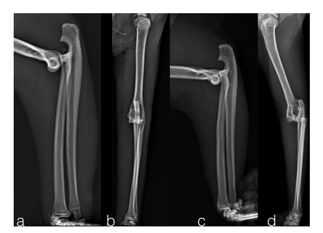
Fig. 1. Pre-operatively radiographs in lateral (a, c) and craniocaudal (b, d) view. Case 1 (a–b); case 2 (c–d).

The case 1 and case 2 were evaluated every 5 days until the final evaluation at 22 and 18 days after surgery, respectively. The implants were well tolerated with acceptable three legs gait in both cats. The owners reported no management's concern of the patient at home. At the final control, the stabilization bars were removed after clinical and radiographic evidence of joint reduction and stability. The Kirschner wires were left for further 5 days later, to be useful in case of reluxation. Protective caps and bandage were applied on the tips of Kirschner wires until their removal. Dermatitis around the pin tracts was the only minor complications associated with the transarticular external skeletal fixation, resolved after implants removal. Thirty days after surgery, in both cases, the clinical examination showed a grade 3/4° lameness (Brunnenberg, 2001), a limited range of motion (150^{\circ}/70^{\circ}) and a painless manipulation with no swelling visible. Mild osteoarthrosis was present at radiographic control. For both cats, physiotherapy sessions was not require; however, the owners did some home exercises like gentle passive motions, while restricted movement was continued for another 3 weeks. At 8 weeks after reduction, the cats were no longer lame and the exercise was well tolerated. The range of motion was mildly reduced without pain or joint crepitation. The radiographic follow-up at 2 months after reduction showed mild evidence of osteoarthritis (Fig. 3). The