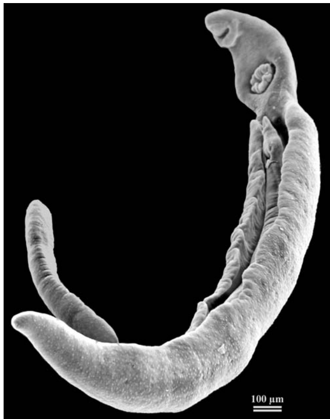
Figure 1. A schistosome pair, with the thin female located in the male gynaecophoral canal. doi:10.1371/journal.pone.0003328.g001

To that end, we performed multiple infections of definitive hosts with a first infection using parasites of both sexes followed by either male or female re-infection. Divorce rate per host ranged between