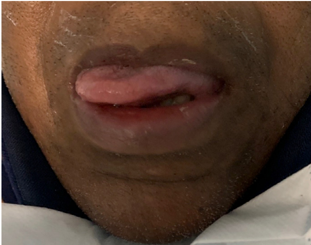
Fig. 2 – Tongue deviation to the right observed on postoperative day 1 (POD1) in a patient with hypoglossal nerve injury.

ities were found. Computer tomography angiography (CTA) of his head and neck did not demonstrate any vascular occlusion. MRI of the brain without contrast revealed no evidence of acute infarct, hemorrhage, or mass effect. On review of the CTA images, the right C1 lateral mass screw was noted to extend 4 mm beyond the anterior cortical margin of the C1 arch (Fig. 3). The hypoglossal palsy was felt to be attributable to direct mechanical compression or injury from the C1 lateral mass screw. Findings were discussed with the patient and a decision was made to proceed with revision of the right C1 screw.