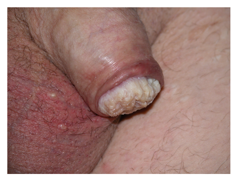
FIGURE 1. Macroscopic aspect. Squamous cell carcinoma of the glans penis, subsequently treated with partial penectomy.

The urological screening consisted of an annual sonography of the native and transplanted kidneys, bladder, and prostate; PSA measurement; urinalysis and urinary cytology. Microhematuria prompted urological investigation and physical examination revealed a fungating lesion of the glans [Fig. 1].