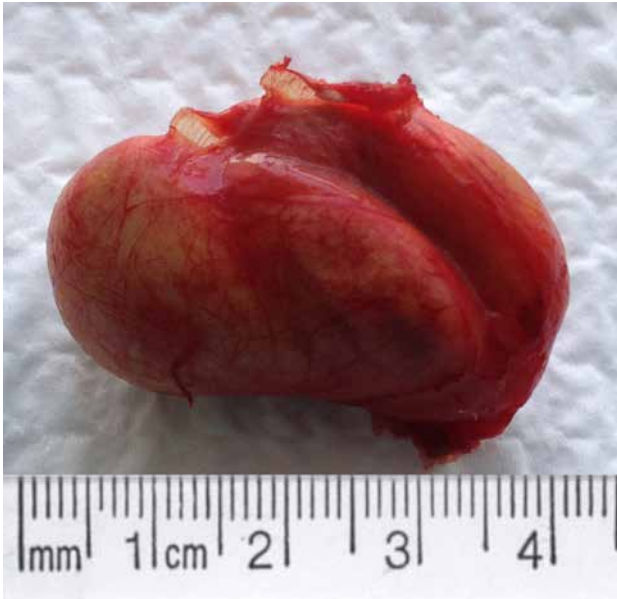
Figure 2: A 6-year old boy. A surgical specimen of the lesion in the left submental region