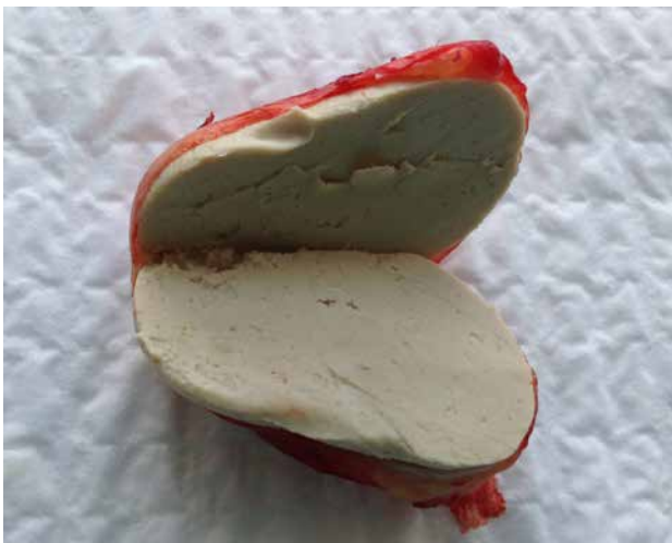
Figure 3: A 6-year old boy. Dissected surgical specimen of the lesion in the left submental region. Cheesy, epidermoid content can be seen

contrast computed tomography well shaped, capsulated and probably filled with fluid structure was visualized of approximately AP=29 mm, T=26 mm, H=24 mm. No infiltration of surrounding tissues was noted (Figure 4).