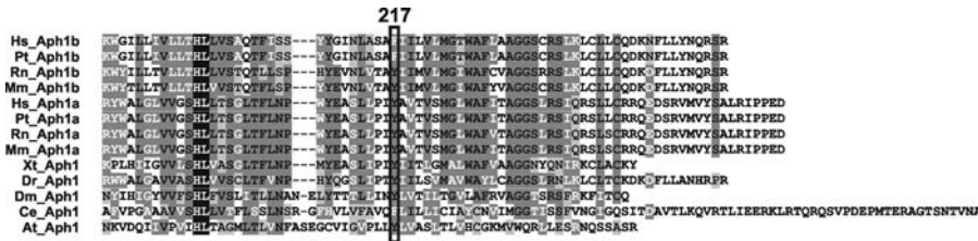
Figure 1. Alignment of vertebrate and invertebrate amino acid sequences of the region within APH1 surrounding residue 217. A black background indicates identical amino acid residues; a grey background indicates a conservative amino acid change. Abbreviations: Hs, Homo sapiens ; Pt, Pan troglodytes ; Rn, Rattus norvegicus ; Mm, Mus musculus ; Xt, Xenopus tropicalis ; Dr, Danio rerio ; Dm, Drosophila melanogaster ; Ce, Caenorhabditis elegans ; At, Arabidopsis thaliana . Sequences were aligned using Vector NTI (9.0) with default parameters. doi:10.1371/journal.pone.0003662.g001

substrate APP may be involved in vascular pathogenesis as well, since it metabolises cholesterol [22], physically interacts with LRP1 [23], and gives rise to the amyloid plaque constituents Aβ-40 and -42. Besides these well-studied substrates, the γ-secretase substrates NOTCH3, colony-stimulating factor 1 (CSF1), CD44, neuregulin and ERBB4 may also be involved in the vascular complications in patients with the APH1B Phe217Leu variation. Mutations in NOTCH3 may cause cerebral autosomal dominant arteriopathy with subcortical infarcts and leukoencephalopathy (CADASIL), a syndrome characterized by systemic vascular smooth muscle cell (VSMC) degeneration [24]. CSF1 can contribute to atherosclerosis development via fatty streak formation and progression to complex fibrous lesions [25], and CD44 may enhance atherosclerosis pathogenesis via reactive oxygen species [26], whereas neuregulin and ERBB4 are necessary for vascular growth and development [27–29].