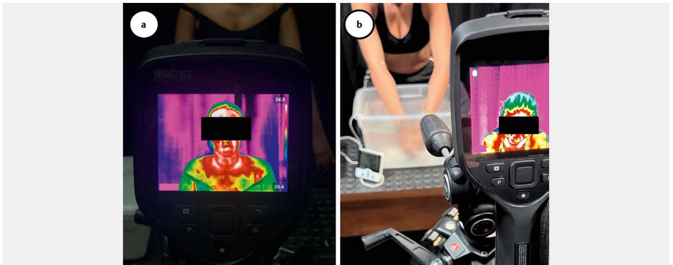
► Fig. 1 (a) Camera FLIR E75 positioned for acquisition before cold protocol; (b) immersion of both hands in a container of cold water for 5 min.