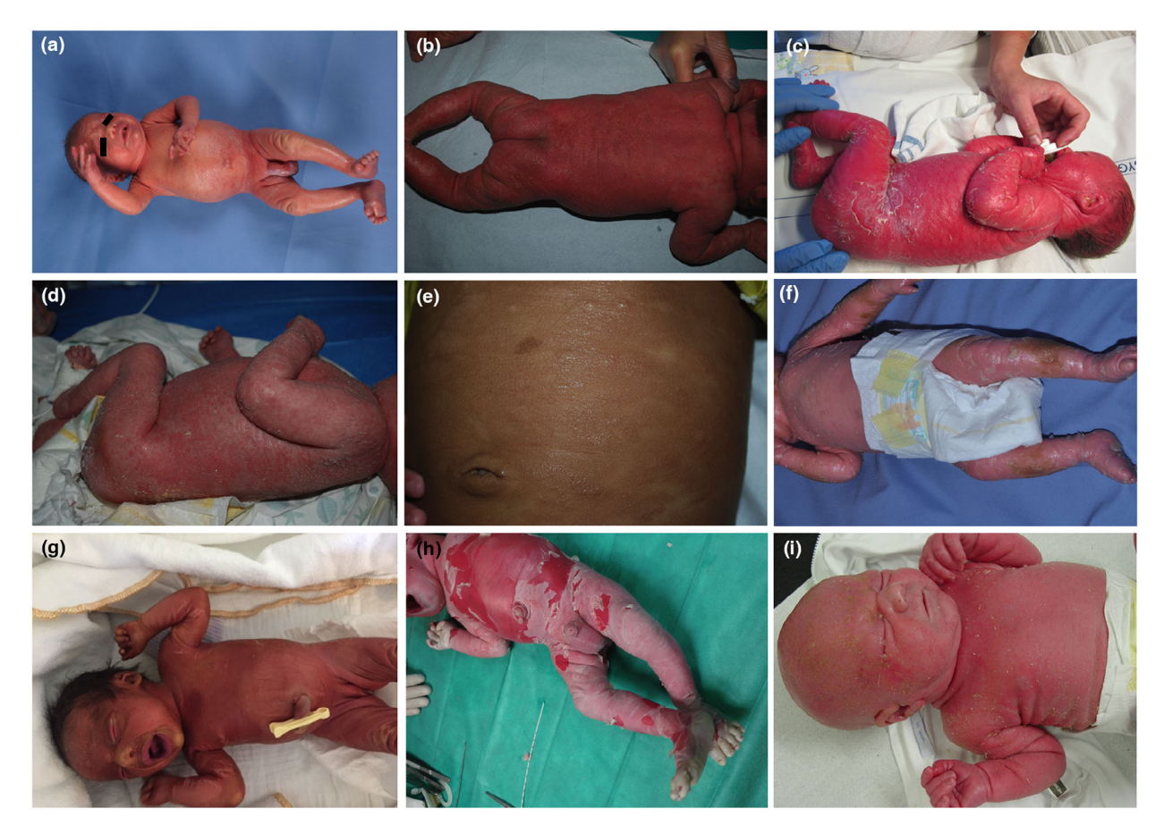
Figure 1 Clinical pictures of patients with neonatal erythroderma. (a) Self-healing collodion baby, (b) Omenn syndrome (courtesy by Iria Neri), (c) Ichthyosis variegata (courtesy by Anette Bygum), (d) Netherton syndrom (courtesy by Iria Neri), (e) diffuse cutaneous mastrocytosis (courtesy by Iria Neri), (f) Harlequin ichthyosis (courtesy by Cristina Has), (g) Ichthyosis NOS, (h) Epidermolytic ichthyosis (courtesy by Cristina Has), (i) Omenn syndrome.

hemidysplasia with ichthyosiform erythroderma and limb defects (CHILD) syndrome has been excluded due to an unilateral erythroderma, and Leiner disease has been excluded because in former cases the disease seemed to be related to NS and Omenn syndrome (OS). <sup>11–13</sup>