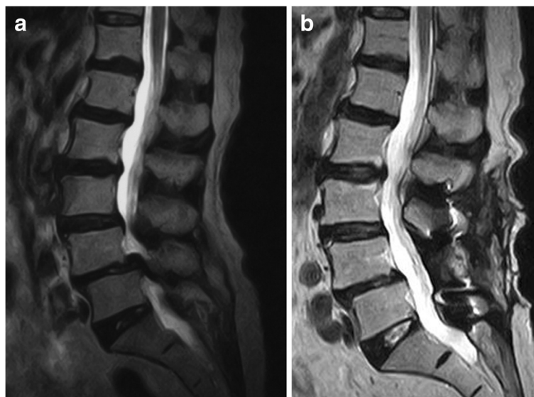
Figure 2 MRI of a 76-year-old female with spondylolisthesis. (a) Preoperative T2-weighted image. (b) Postoperative T2-weighted image.

The Tadpole system is more suitable for elderly patients who have osteoporotic bone and poor general health status and may be at high risk for complex surgeries. The authors have already reported 2-year follow-up clinical results on the Tadpole system in 31 degenerative lumbar spine patients in 2008 [6]. A mean 70.9% improvement rate in the JOA score and 93.5% fusion rate with no major complications were obtained, which showed that this system might be a useful, easy-to-use, and safe spinal instrumentation technique for lumbar fusion surgery.