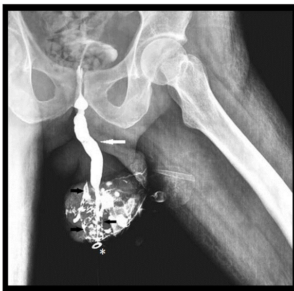
Figure 2. Retrograde urethrogram showing multiple, contrast-filled, narrow, irregular, fistulous tracts (black arrows) arising from the pendulous part of the anterior urethra with significant distortion and irregular, beaded narrowing. The proximal segment of the pendulous part of the anterior urethra shows smooth and regular dilation (white arrow). The distorted external urethral meatus (asterisk) was identified by asking the patient to micturate to observe the main stream of urine.

Chest radiograph (posteroanterior view) ruled out presence of pulmonary Koch’s (both active as well as old, healed pulmonary Koch’s). Scrotal ultrasound revealed normal testes and epididymis. Renal ultrasound showed no calyceal or