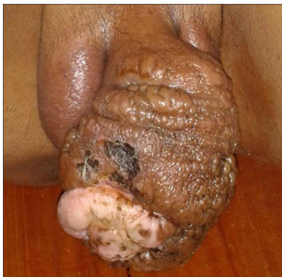
Figure 1. Clinical photograph showing an ulceroproliferative growth of the penis.

history of gradually increasing swelling of the penis for 1 year and a purulent discharge per urethra for the last 6 months. At physical examination, there was an ulceroproliferative growth of the penis (Figure 1). The penis and the glans penis were tender, edematous and indurated. However, both the testes and the epididymis were normal. The vas deferens was normal on palpation. The prostate was normal on rectal examination. Preliminary laboratory investigations revealed high sedimentation, C-reactive protein (CRP) and leukocytosis. He was referred to our Radio-Diagnosis Department for Retrograde Urethrography – Voiding Cystourethrography (RGU-VCUG) evaluation.