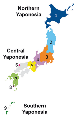
Fig. 1 Geographical map of Yaponesia. The different regions are color-coded and numbered to correspond to Fig. 3

Yaponesia (Fig. 1). Northern Yaponesia consists of Hokkaido (sometimes Sakhalin and Kuril Islands may also be included [2]), Central Yaponesia consists of Honshu, Shikoku, and Kyushu, and Southern Yaponesia consists of the islands in Okinawa prefecture, also known as Ryukyu Islands. Besides people from Okinawa and the Ainu from Hokkaido, people who inhabit the Japanese Archipelago can be referred to as Yamato people.