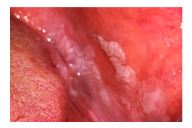
Figure 4. Oral manifestation of IBD: lichen planus in the left buccal mucosa.

Oral lichen planus is a chronic inflammatory dermatosis that affects the oral mucosa and has six different clinical presentations, it can be reticular, erosive/ulcerative, bullous, plaque-like, papular, or atrophic (Figure 4). The aetiology is still unknown, but it is thought to being related to an immune-mediated mechanism that involves dendritic cells and T cells. Oral lichenoid drug reactions have proven to be related to mesalazine and sulfasalazine [16] used in the therapy of IBD patients.