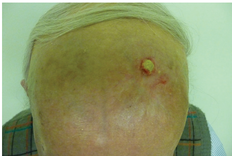
FIGURE 4: A localized infection of Enterobacter cloacae developed on the patient's left forehead.

almost 100% mortality rate [19, 20], while smaller tumors (<5 cm) correlated with better outcomes [4, 10].