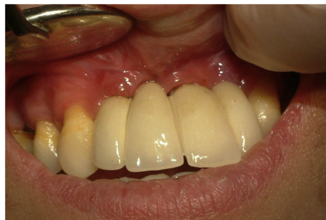
Fig. 4. The implants were loaded after six months with a fixed prosthetic restoration.

The implants were left to integrate for three months (Fig. 3). However, in the second stage surgery it was seen that the right implant exposed through the soft tissue. The area was surgically exposed and a bone defect of several millimeters on the buccal