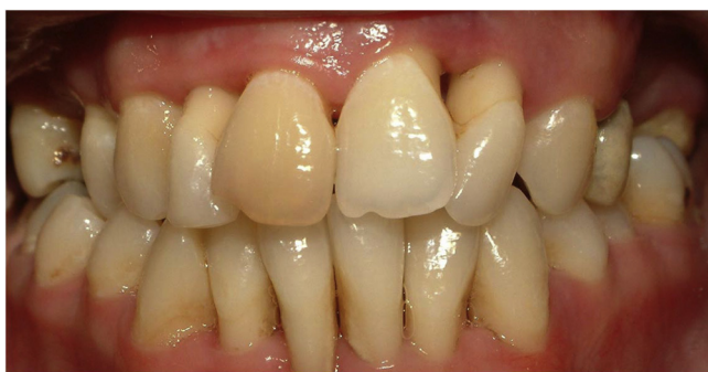
Fig. 1. Maxillary four incisors were found to be grade 3 mobile according to Miller's classification.

treatment time, little or no resorption of bone, and fairly predictable results [1].