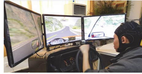
FIGURE 1: Snapshot of the experimental setup.

Although many EEG-based methods have been proven to detect driver fatigue, the optimal method has not yet been determined. Furthermore, the EEG with more channels usually restricts its application in the detection of driver fatigue. Using the data from 12 subjects, the detection model for driver fatigue was developed with a single channel. Four types of entropies were deployed in this work: SE, FE, AE, and PE. The classification procedure was implemented by ten classifiers: K -Nearest Neighbors (KNN), SVM with linear kernel (LS), SVM with RBF kernel (RS), Gaussian Process (GP), Decision Tree (DT), RF, Multilayer Perceptron (MLP), AdaBoost (AB), Gaussian Naïve Bayes (GNB), and Quadratic Discriminant Analysis (QDA). The aims of the present study