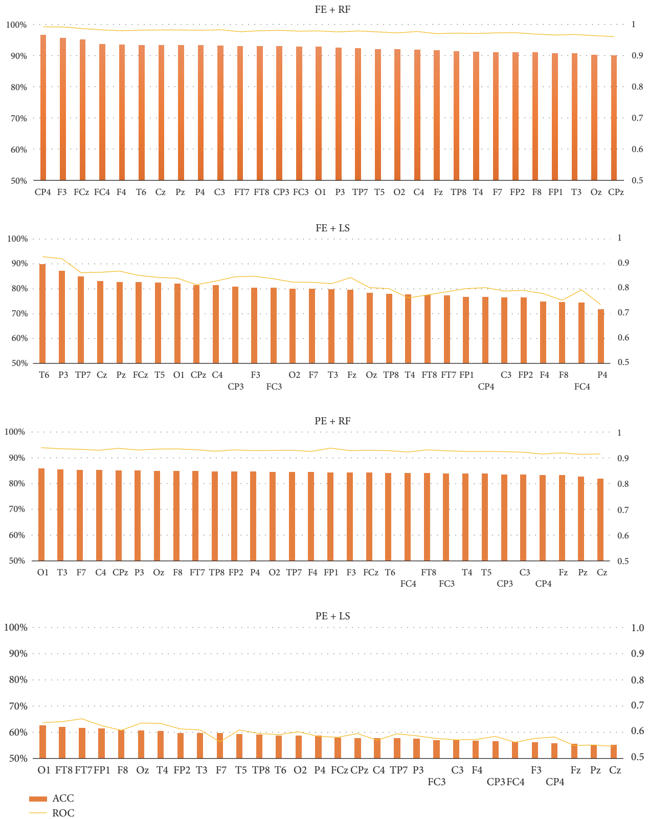
FIGURE 4: Comparison of all channels based on feature FE and classifier RF of 12 subjects. The left vertical coordinate is for accuracy (%), while the right vertical coordinate is for AUC. The horizontal coordinate is for channel.