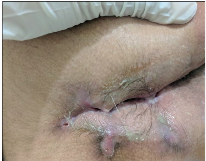
Figure 2: Perianal Pus discharging sinuses