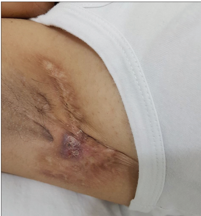
Figure 3: Scarring present in axilla

staining for acid fast bacilli and fungi. Focal cryptitis and occasional crypt abscess was also observed. These findings were consistent with granulomatous inflammation.