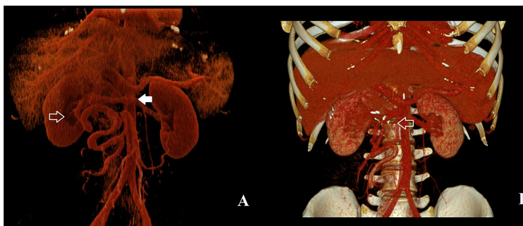
Fig. 2 A 3D reconstructions of vascular system from coronal CT scans: A Preoperative CT reconstruction: the full white arrow points to the proximal section of the SMV, the contoured white arrow points towards collaterals running through the duodenum. B Postoperative CT reconstruction shows patent anastomosis between collateral branch from the distal section of the SMV and the anterior inferior pancreaticoduodenal vein