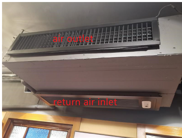
Figure 1. Inlet and outlet of air conditioner described in study of COVID-19 outbreak associated with air conditioning in restaurant, Guangzhou, China, 2020 (2).

We agree that virus transmission in this outbreak could be explained by droplet transmission and the possibility that persons move around, touch surfaces, go to the restroom, or engage in other close contact. We con-