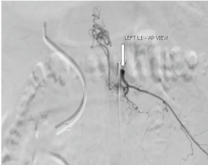
Image 2. Spinal angiogram showing dural arteriovenous fistula (white arrow) arising from left lumbar artery of the first lumbar vertebra (L1) between a dural branch of the spinal ramus of a radicular artery and an intradural medullary vein. Also shown is the venous component coming off the arteriovenous malformation, which is coiled and extends superiorly to the sixth thoracic vertebra (T6) level and inferiorly to the fifth lumbar vertebra (L5) level. AP, anteroposterior.

recommended that interventional radiology (IR) be consulted for an IR-guided lumbar puncture (LP) as GBS and CIDP were both still on the differential. Interventional radiology-guided LP was advised to minimize the risk of affecting the AVM. Spinal angiography showed a type one dural arteriovenous fistula supplied by a radiculomedullary branch that arose from the left L1 lumbar artery (Image 2), with a coiled venous component extending superiorly to the T6 level and inferiorly to the L5 level.