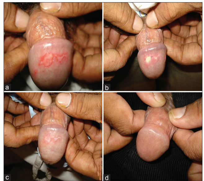
Figure 3: (a) Group 3: Superficial erosions present on glans before treatment with topical 4% zinc sulfate, (b) Group 3: Same patient at 5 days of follow-up periods after treatment with topical 4% zinc sulfate showing partial resolution of lesions, (c) Group 3: Same patient after 10 days of treatment with topical 4% zinc sulfate, showing almost complete resolution of lesions, (d) Group 3: Same patient after treatment with topical 4% zinc sulfate at 6 months follow-up period without any recurrences