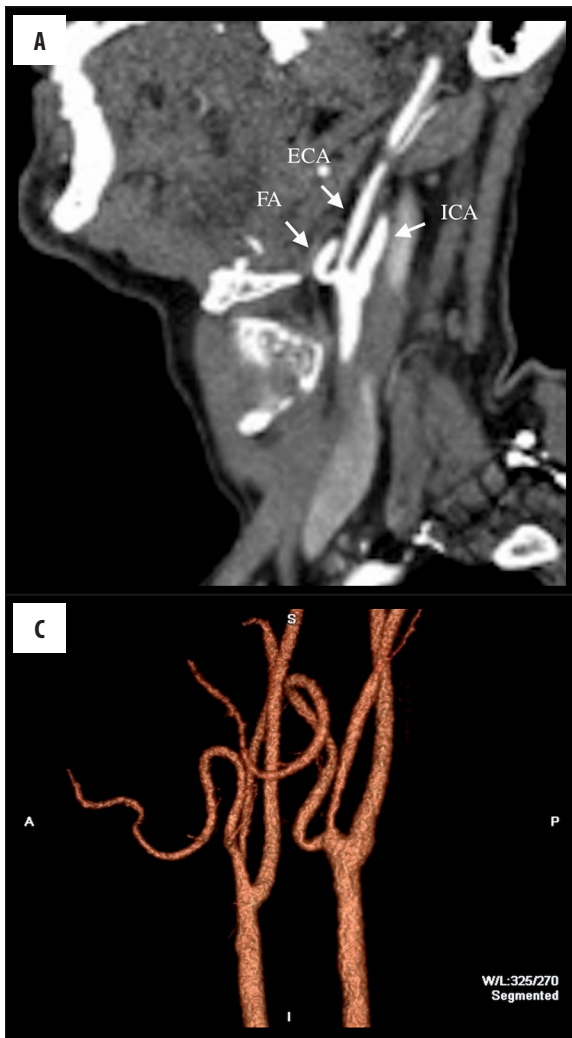
Figure 3. Sagittal reformat (A), MIP image (B), and 3-D reformat image (C) of the CT angiography show the facial artery, the external carotid artery and the internal carotid artery arising from the common carotid artery.