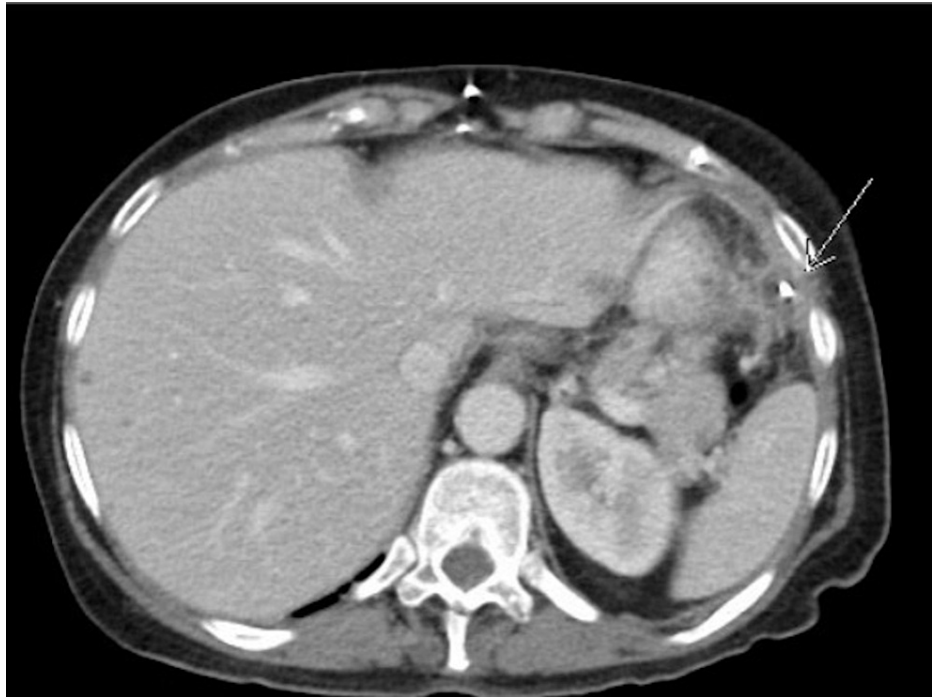
FIGURE 2: CT abdomen and pelvis with contrast showing fluid collection hypodense around the VP shunt denoted with a white arrow.