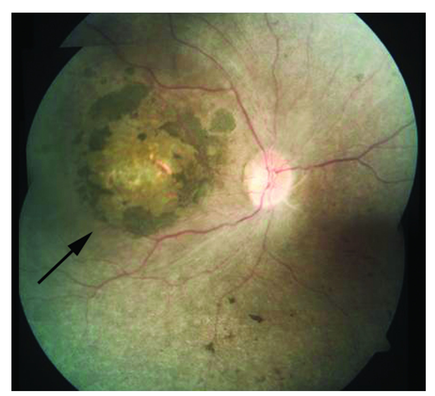
Figure 2. Retinal image from individual with LCA due to mutations in NMNAT1 . Composite fundus image of the right eye of subject II-1, LVPEI family LCA-100, showing pallor of the optic disc, attenuation of the retinal blood vessels, pigment disruption and atrophic changes in the macula (arrow), and scattered pigment clumping in the peripheral retina. The optic disc is approximately 1.75 mm in diameter.