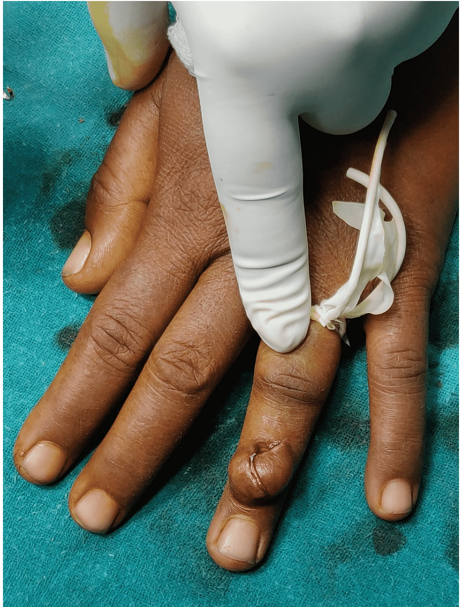
FIGURE 3: Curvilinear incision over the swelling