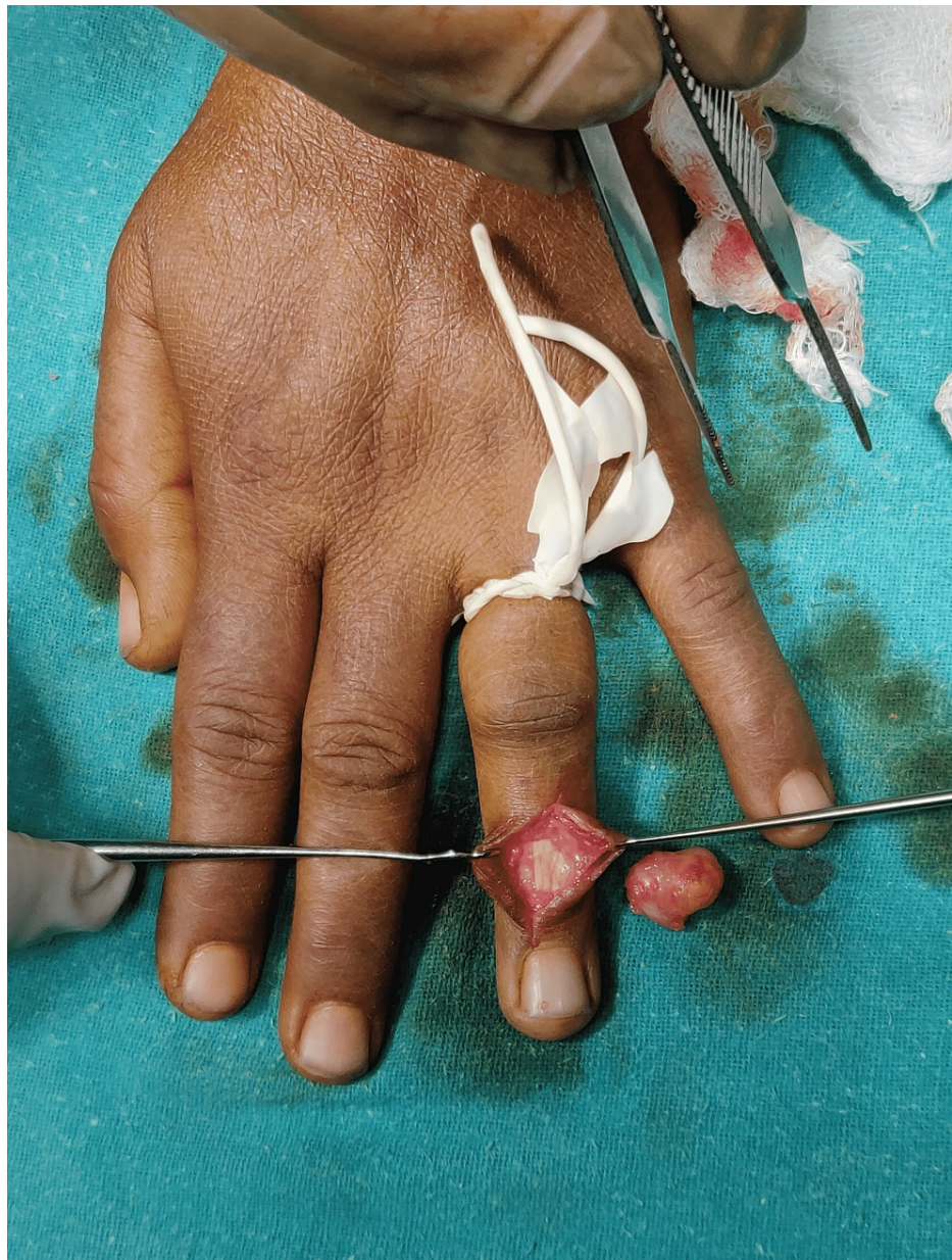
FIGURE 4: Tumour excised completely

The excised tumour was sent for histopathological examination, which showed polygonal to round histiocytes surrounded by multinucleated giant cells, fibro-fatty tissue (Figure 5) suggestive of GCTTS. Postoperatively follow-up was held every six months, and a full recovery was noticed without any significant restriction of movement of the finger. The patient was able to perform her activities of daily living. No evidence of recurrence was noted on clinical and radiological examination.