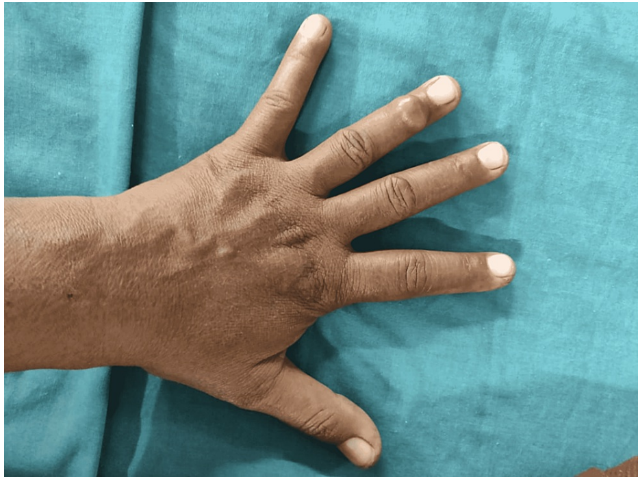
FIGURE 1: Swelling on dorsal aspect of ring finger

uniform in consistency. The swelling was movable sideways with no attachment to the bone when examined clinically. It adhered to the underlying soft tissue and hence moved with the movement of the finger. Normal capillary circulation was present. Paresthesia was not noted.