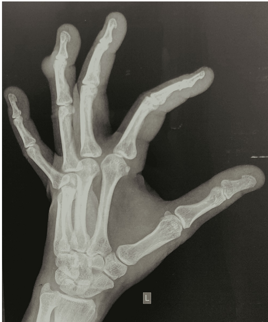
FIGURE 2: X-ray of left hand showing soft tissue shadow in ring finger

The patient was surgically fit and an excisional biopsy of the underlying swelling was performed. It was done under local anaesthesia and sedation. Cutting the little finger of the sterile gloves, tourniquet was prepared and used for the surgery. A curvilinear incision was taken over the swelling (Figure 3). Soft tissue dissection was done and the tumour was seen adhered to the underlying extensor digitorum tendon of ring finger. Excision of tumour was easy and was excised completely (Figure 4). The closure was done in layers and the tourniquet was released.