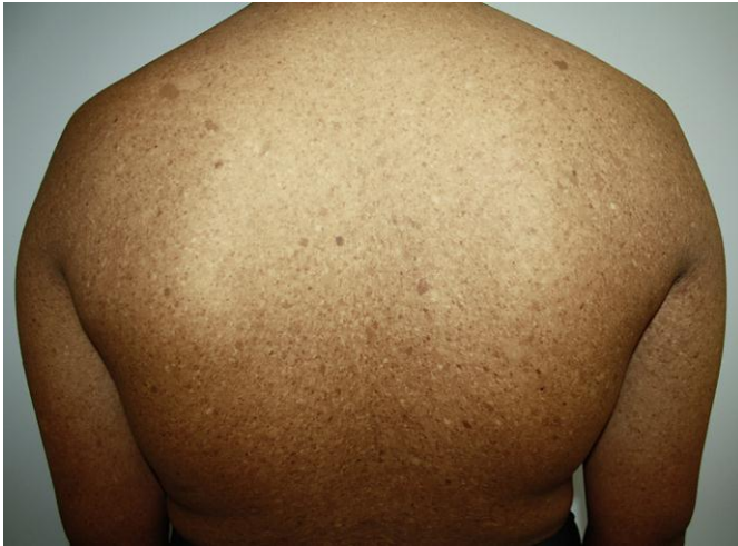
Fig. 2. A mixture of hypopigmented and hyperpigmented macules on the patient's trunk and extremities.