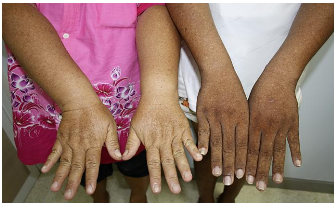
Fig. 3. Clinical characteristics of DUH in the patient (right) and his mother (left).