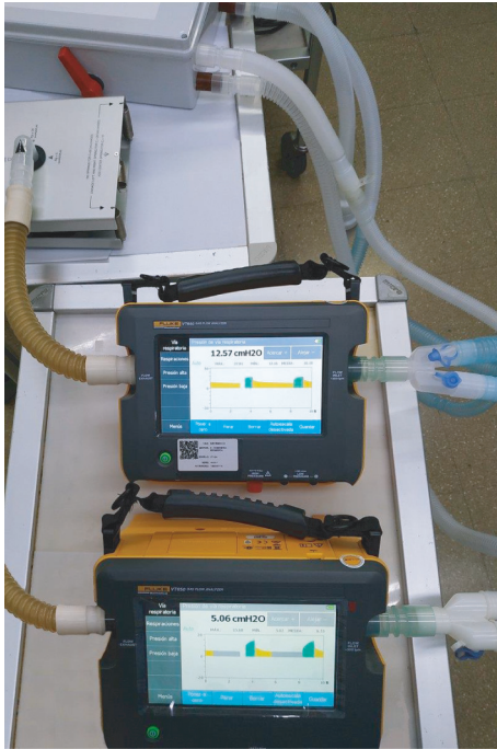
FIGURE 2: The experimental model: a ventilator connected through the DuplicAR ® device to two gas flow analyzers and their respective test lungs.

PEEP valve, causing a disproportionate increase in the VT delivered to Subject A.