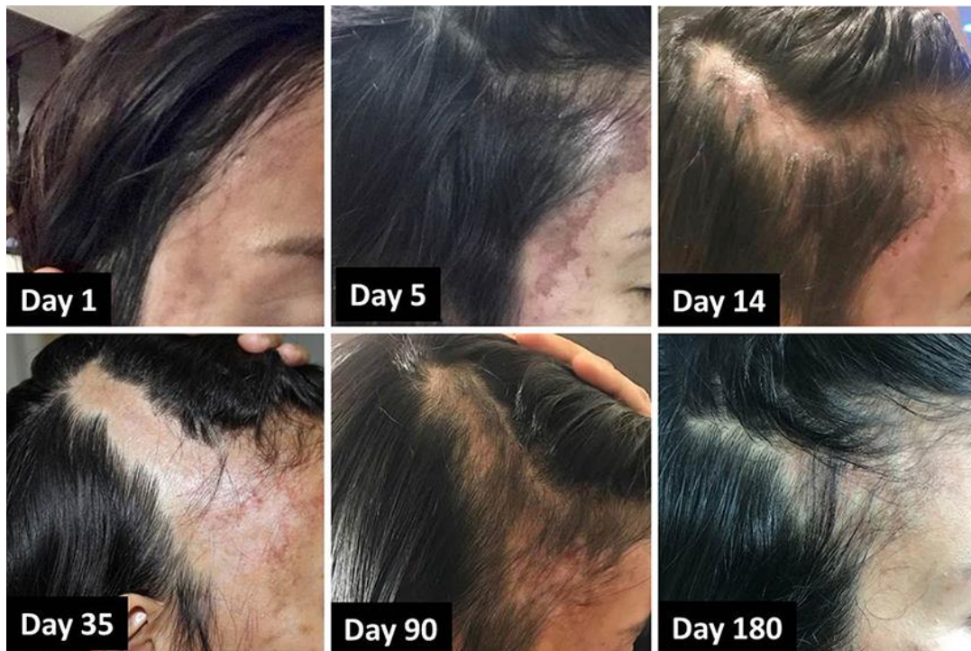
Fig. 1. Vascular compromise after autologous fat grafting into the temple leading to skin necrosis and alopecia, which is generally reversible within 6 months, except for the area of previous skin necrosis.