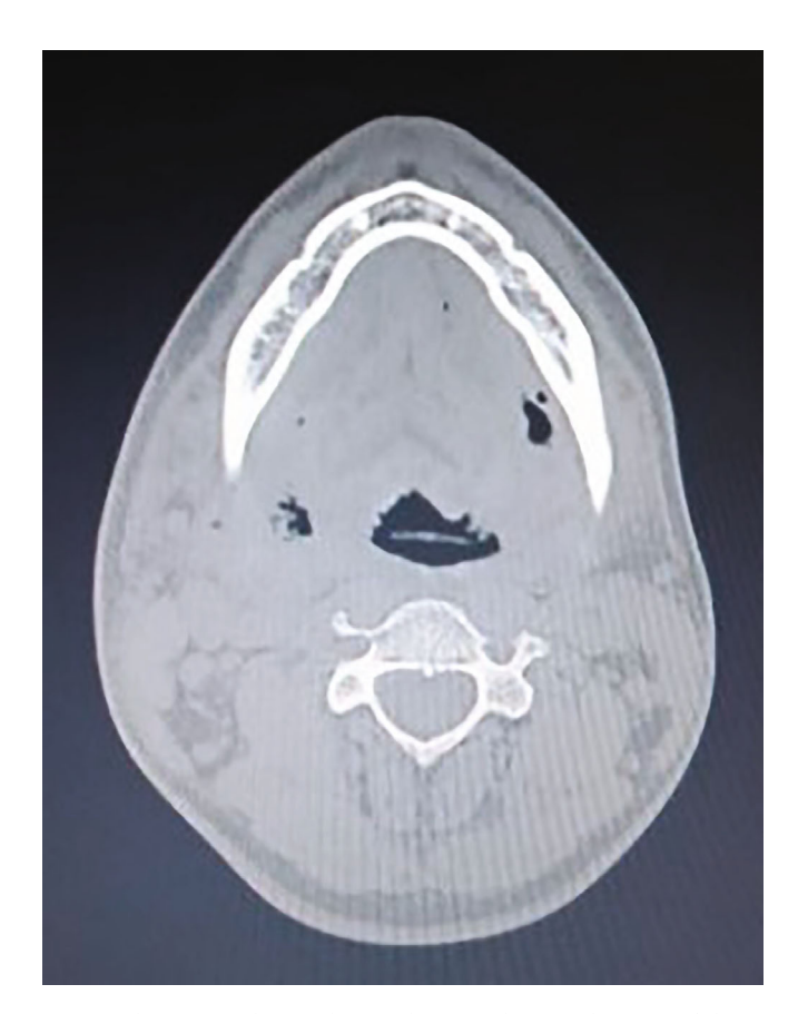
FIGURE 2: Computed tomography axial view showing the initial aspect of the patient's face.

status. After 1 year of treatment, the patient was invited by telephone to follow-up; however, he did not return to our service and only reported no symptomatology.