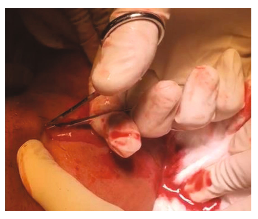
FIGURE 4: Submandibular incision and purulent collection drainage.

Here, the antibiotic therapy used was Metronidazole and Rocefin at the beginning, with a later switch to Tazocin and then to Meropenem and Targocid after drainage.