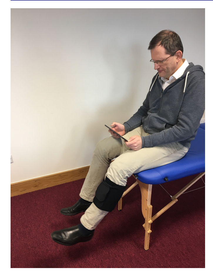
Figure 1 User setup of biofeedback system with single inertial measurement unit placed on the shin and associated tablet application (written consent provided for use of image).