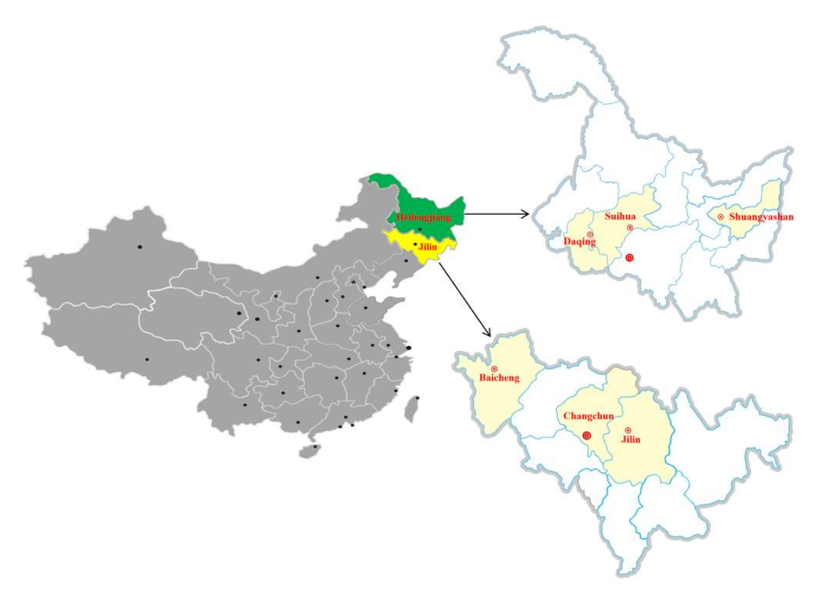
Figure 2. Geographic positions where this study was conducted. Dot represents provincial capital.

The present study was conducted in three cities (Changchun, Jilin, and Baicheng) of the Jilin province (40°50'-46°19' N; 121°38'-131°19' E); and three cities (Daqing, Shuangyashan, and Suihua) of the Heilongjiang province (43°26'-53°33' N; 121°11'-135°05' E), in northeastern China between January 2019 and September 2020 (Figure 2). At last, 894 domestic cows were randomly selected as target animals for this study to collect the serum and milk. In this study, all the included cows were kept to produce milk for sale or self-supply. The first step was to collect the milk samples due to its convenience.