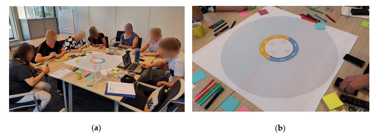
Figure 2. The caregivers mapped the typical day of a resident with dementia: (a) First, they were asked to reflect and make notes individually. (b) Next, participants were asked to share their thoughts with the group and to place their notes on the 24-h timeline.