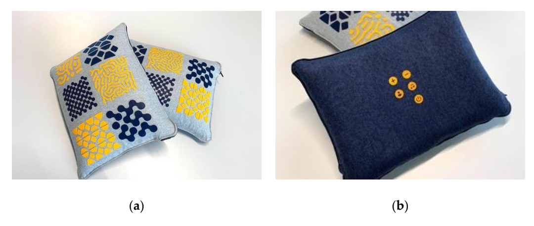
Figure 1. Vita served as an example of audio-based technology: (a) Vita is a cushion with conductive touchpads to play audio content and (b) with buttons on the reverse side to adjust the settings or volume.

their caregivers [53]. The participatory workshops served as introductory sessions for the professional caregivers overseeing Vita's deployment in the care facility. The aim was to encourage and stimulate creativity in the use of Vita by professional caregivers during this field study by generating and designing concrete scenarios for using ABT in residential dementia care.