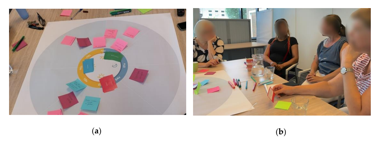
Figure 3. During the second step of the workshops, the professional caregivers were asked to map statements from literature to practice: (a) The cards with statements from literature were stacked in piles, face-down on the poster as in a board game. (b) Each caregiver was asked in-turn to draw a card and to relate the statement to their own experience, after which the group discussed the statement.