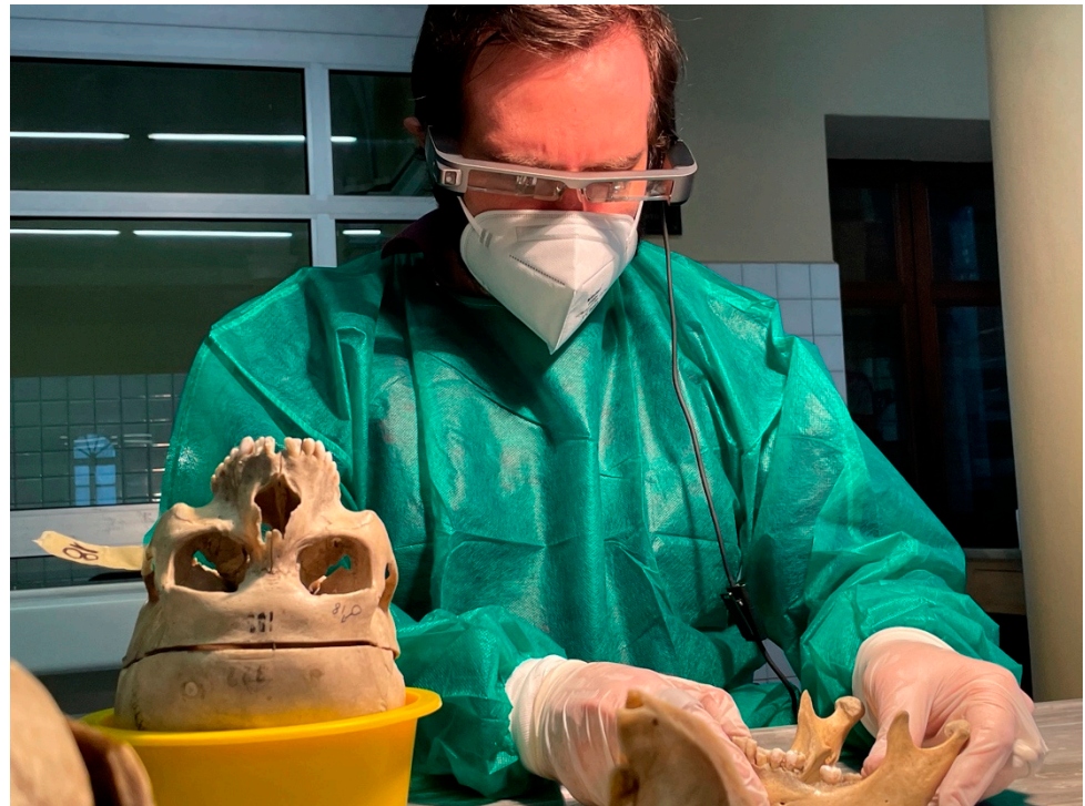
Figure 2. Operator using smart glasses to observe and record dental features on the mandible.