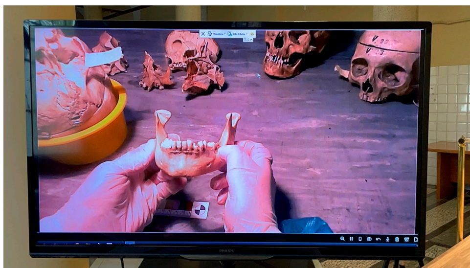
Figure 4. Live streaming images observed remotely from a forensic odontologist.