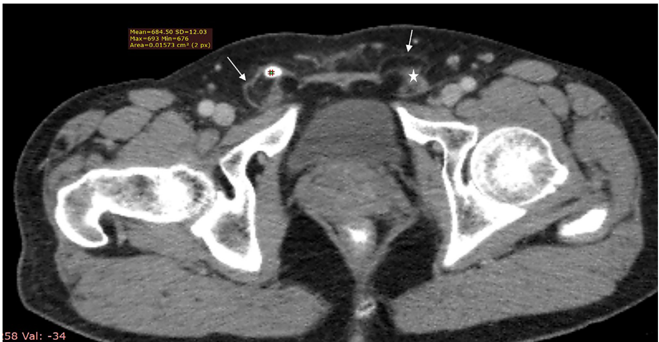
Fig. 2 - MDCT of the abdomen - MPR: At the axial plane (A) At the left side the normal spermatic cord (asterisk) is seen inside the inguinal canal (arrow). At the right side the appendix (open arrow) is seen filled with p.o. contrast agent (684,5 HU) inside the inguinal canal (arrow).