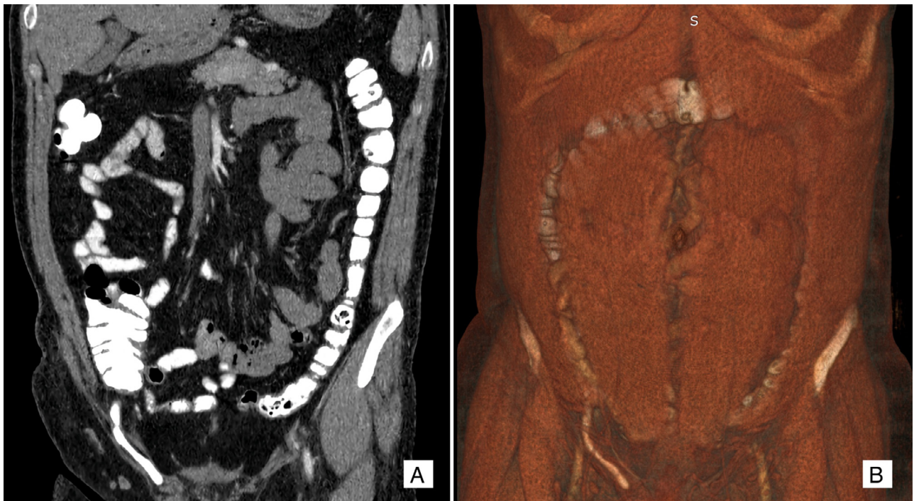
Fig. 1 - A. Coronal MPR and B. Coronal 3D shows the normal appendix within the right inguinal hernia.