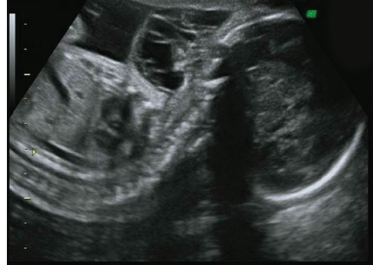
FIGURE 2: Ultrasound image at 26 weeks' gestation of a cervical teratoma.

The patient was a 33-year-old who was detected to have a right-sided, unilateral 5 cm neck mass at a 30-week scan. This extended posteriorly up to the cervical spine. The mass had thin walls with solid areas present and few echogenic areas (Figure 4). Vascularity was not increased. The amniotic fluid index was 11 cm. Our provisional diagnosis was a possible teratoma, lymphangioma, or neuroblastoma as the location and nature of the mass made the diagnosis of a thyroid lesion or cystic hygroma unlikely. The mass was stable with no development of hydramnios in subsequent scans. The patient underwent an elective Caesarean section at term. The mass was excised postnatally and histologically it was a lymphangioma.