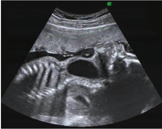
FIGURE 1: Ultrasound image at 27 weeks' gestation of a bronchogenic cyst.

well-defined borders and no increased vascularity (Figure 2). An epignathus was excluded as the tumour was not arising from the mouth. The amniotic fluid index was normal at 14 cm. The diagnosis then was a cervical teratoma. The patient delivered via elective Caesarean section at term. A teratoma was confirmed postnatally after surgical excision.