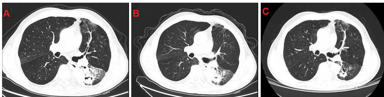
Figure 1 (A) CT revealed large dense shadows and cavity formation in the inferior lobe of the left lung. (B) The results of CT re-examination suggested that, the area of infection in the inferior lobe of the left lung was significantly reduced and the cavity was smaller. (C) The condition of the lung was further improved than before.