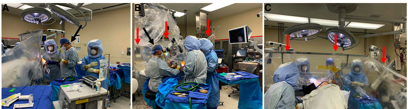
FIG. 1. Operating room logistics. A: Surgeon ( black arrow ) with N95 respirator covered with a surgical mask in sterile area while other operating room personnel use a PAPR. B: Surgeon using operating microscope ( black arrow ) in sterile area separated from patient with clear drape ( red arrows ). C: Clear surgical drape ( red arrows ) separating the sterile area and preventing viral aerosolization from traveling toward the surgeon.