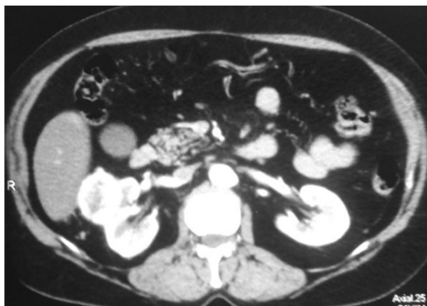
Figure 1. Cross section of a CT showing an anterior tumor and exophytic.

Renal localization of tuberculosis is the result of hematogenous spread of mycobacteria from a pulmonary focus and occurs in 8 to 10% of cases of primary infection tuberculous. 4