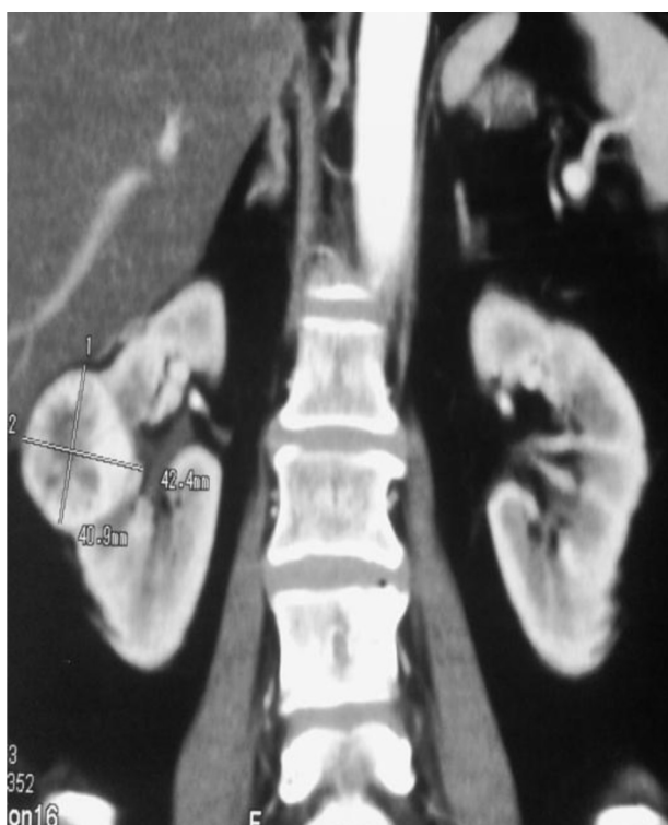
Figure 2. Coronal CT showing a mid-renal tumor location and proximity to the urinary tract

The originality of our observation is based on the double chance discovery of a tumor of the kidney and renal tuberculosis. While the chance discovery, ultrasound or tomodensitométrique, kidney tumor is frequent (more than 50% of kidney cancer diagnoses), 6 the chance discovery of renal tuberculosis is exceptional. In most