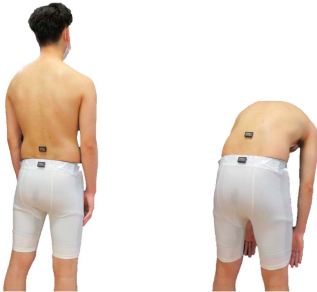
Figure 1. Bending task. The accelerometers were attached to the spinous process (L3) and sacral spine (S2). We recorded kinematic data during the lumbar flexion task.

the peak angular velocity of lumbar flexion ( ^{\circ}/s^2 ); and (3) return from flexion ( ^{\circ}/s^2 ). The maximum lumbar flexion angle ( ^{\circ} ) and peak angular velocity of lumbar flexion ( ^{\circ}/s^2 ) were calculated in phase 1. The peak angular velocity of lumbar return from flexion ( ^{\circ}/s^2 ) was calculated in phase 2. We used the average of the peak angular velocity for each trial. In addition, phase 1 was from the start cue to the time point at which the subject's lumbar flexion angle was maximum. Phase 2 was from the time point at which the subject's lumbar flexion angle was the maximum to the time point at which the subject returned from flexion. Subjects were in a natural posture with a neutral lumbar spine position at both the time point at the start cue and the subject's return from flexion. Thus, the maximum lumbar flexion angle was the same for phases 1 and 2.