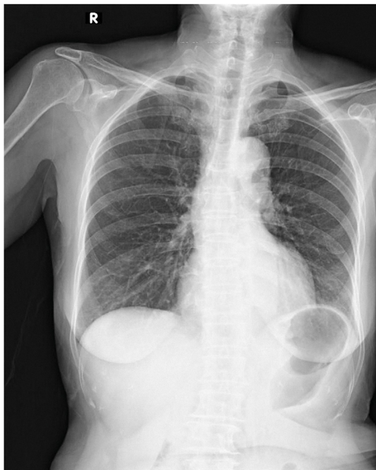
Fig. 1. Preoperative chest X-ray did not show any abnormal finding.