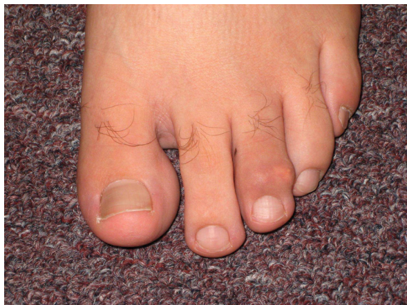
Figure 2 Left foot exhibiting diffuse swelling with prominent DIP involvement.

The exact pathophysiology of both rheumatic and immune-mediated disorders is not fully understood. It is