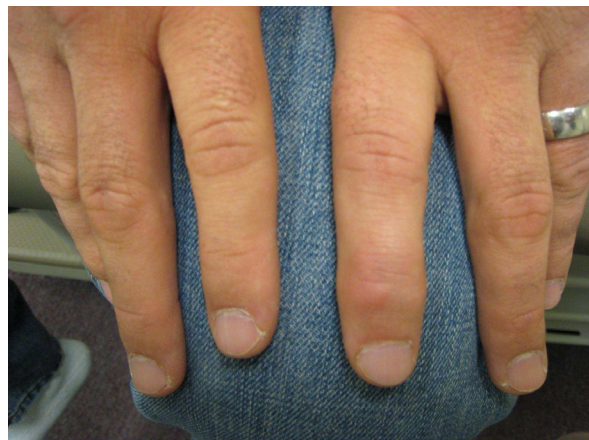
Figure 1 Left index finger demonstrating DIP involvement.