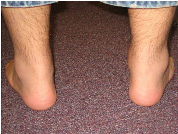
Figure 3 Posterior view of ankles showing swelling of the right Achilles tendon and periarticular swelling.

quite likely, however, that multiple factors including genetic predisposition, environmental factors such as CMV infection, drug exposure, abnormal reconstitution of the immune system, and direct transfer of pathogenic hematopoietic stem cells from the donor that could generate autoreactive clones in allogeneic transplants—possibly the case in our patient, might participate. Inflammatory cytokines, chemokines and adhesion molecules, particularly interleukin-8 and drugs used during SCT such as cyclosporine A or tacrolimus may also play an important role in inducing vascular endothelial damage leading to TTP-like syndromes.