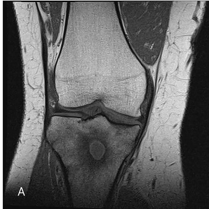
Fig. 1A – T1 coronal MR image shows a Brodie's abscess with the characteristic “penumbra sign” (thin mildly hyperintense rim of granulation tissue surrounding a low intensity fluid filled abscess cavity).