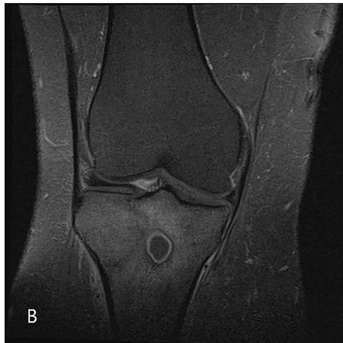
Fig. 1B – T1 post contrast fat saturation image shows enhancement of the granulation tissue.

was discharged on the fifth postoperative day. At follow-up 2 months after surgery, she remained free of symptoms (Fig. 1).