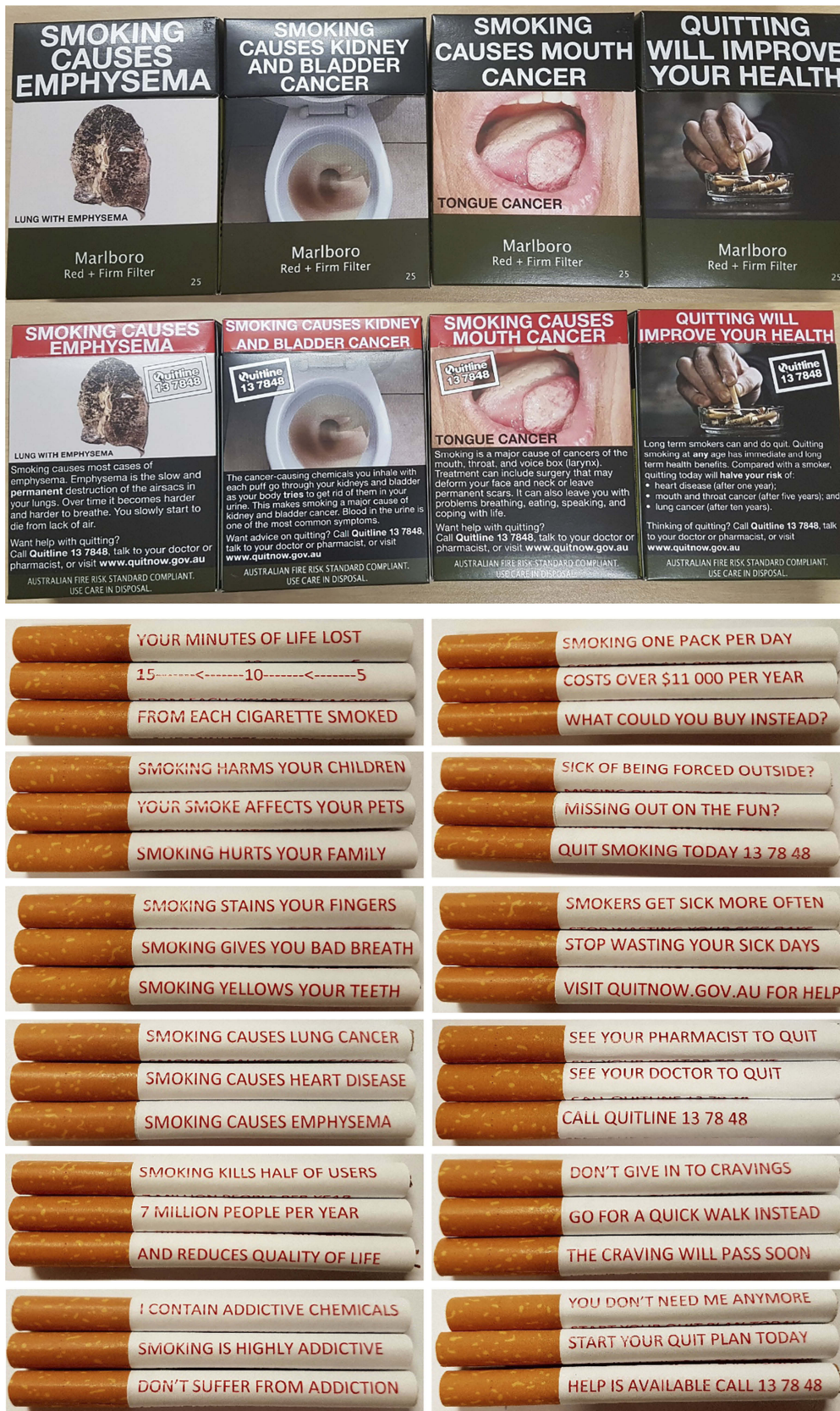
Figure 1 The current Australian cigarette packaging and twelve cigarette-stick warnings utilized in the focus groups and phone interviews.