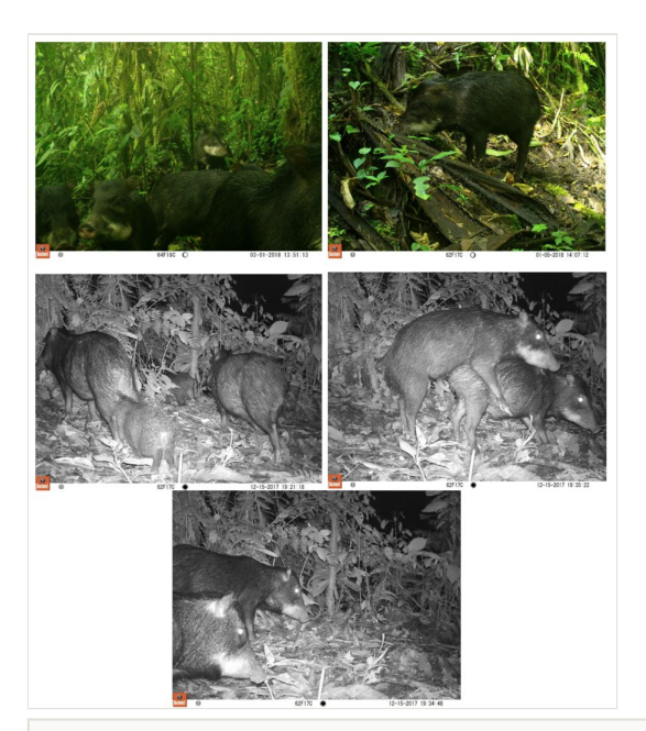
Figure 2. doi Photographs of white-lipped peccaries ( Tayassu pecari ) taken by camera traps in the study site.