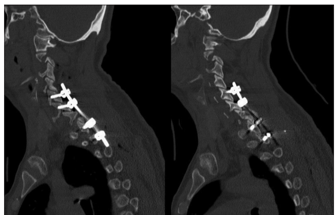
Figure 3: Postoperative sagittal computed tomography scan of the cervical spine demonstrating complete reduction of the deformity (C7 flexion-distraction injury) by posterior spinal fixation with C5 and C6 lateral mass screws and T1 and T2 pedicular screws insertion. The reduction of the deformity has resulted in normal cervical spine alignment and intact canal

developed hypotension and died and could not be operated. [10] Wong and Yu [12] also reported a chance fracture of C4 and quadriplegia in a patient with AS following fall from height. He was managed surgically by a 360° fusion