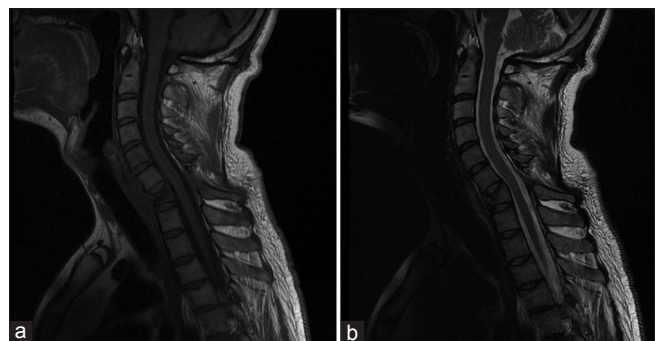
Figure 2: The T1-weighted (a) and T2-weighted (b) sagittal Magnetic resonance imaging of the cervical spine of the patient demonstrating the flexion-distraction injury of the C7 vertebra with rupture of the ligamentum flavum and interspinous and supraspinous ligaments. There is no sign of cervical spinal cord signal change