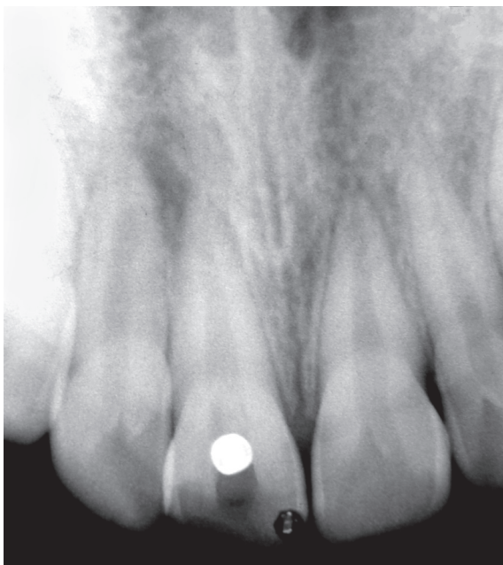
Fig. 2: Preoperative radiograph showing the fractured right maxillary central incisor with a radiopaque foreign object