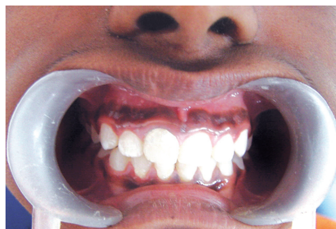
Fig. 5: The tooth after successful restoration