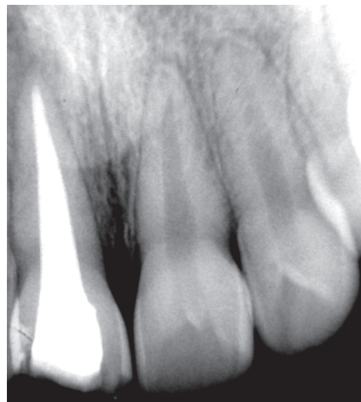
Fig. 4: Radiograph after completion of root canal treatment