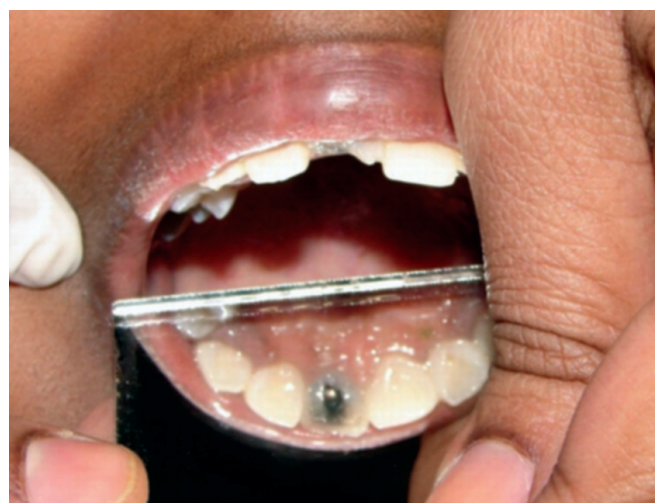
Fig. 1: Fractured right maxillary central incisor tooth with the foreign object

On examination right central incisor was fractured, discolored and tender on percussion with the palatal surface showing access cavity preparation, filled with food debris. Radiographic examination revealed circumscribed radiopacity at the canal orifice extending into the pulp chamber (Fig. 1). The tooth was isolated, access cavity was